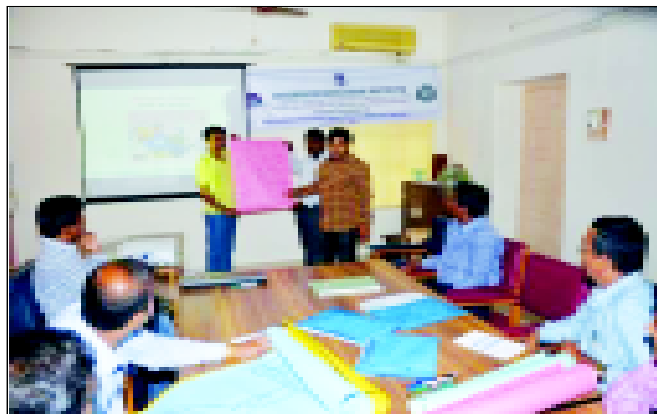
Participants involved in group presentations