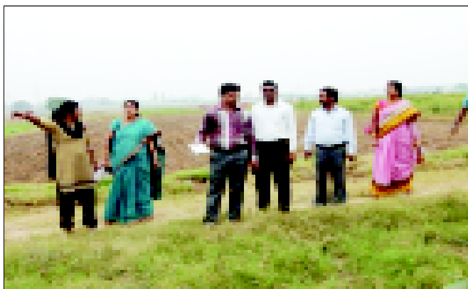
Visit to model integrated farm

An five day programme on “Promotion of integrated farming systems for sustainable livelihoods” was organized from 8 th to 12 th December, 2014 in which 17 officers participated. The programme included latest concepts, farm designs, economics, success cases and field visits to give trainees a wholistic