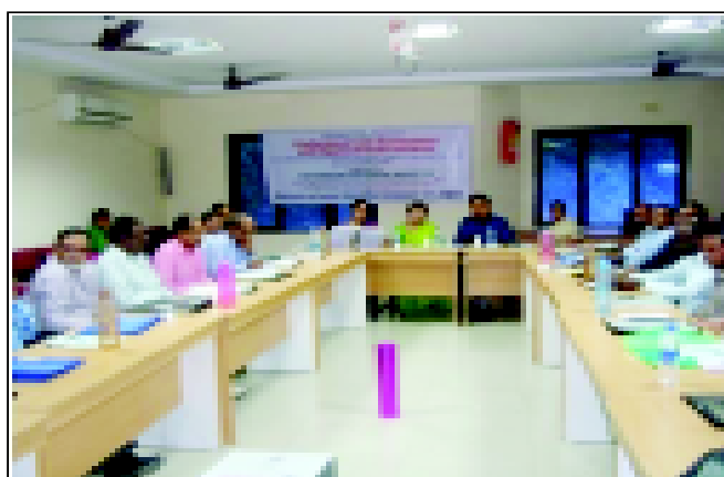
Dignitaries of the valedictory programme