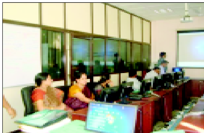
Exposure to Rice Knowledge Management Portal, DRR

The highlights of the training were visits to ICT lab of DRR, ATIC & Kisan Call Centre of PJTSAU, Farmer Call Centre, Hyderabad, ICT venture at Hayath Nagar Research Farm, CRIDA.