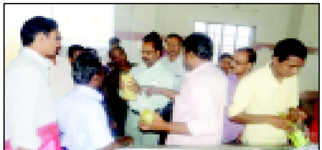
Exposure to polyhouses, Jukkal, Shamshabad