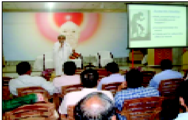
Orientation at Brahmakumari's academy, Bhubaneswar

Creative minds are most productive. Without creativity there would be no progress and we would be