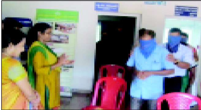
Eight chairs management game