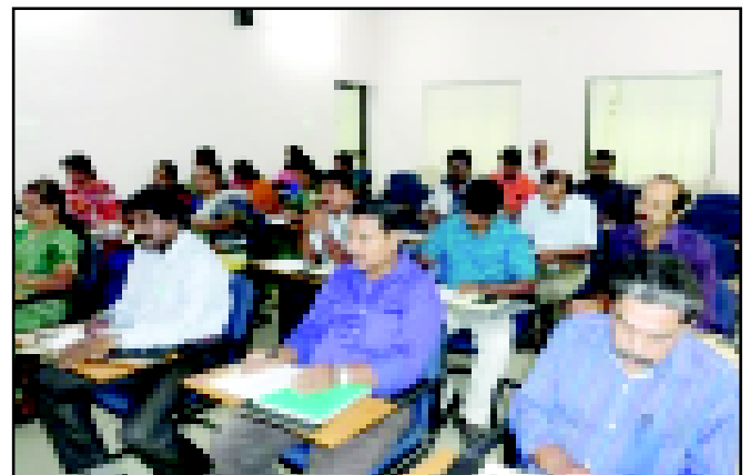
Officers of the programme