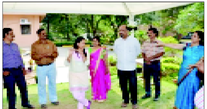
Trainees introduction game

Powerful leaders create powerful teams. Leadership is a character of confidence, trust, discipline and management. In the present scenario, extension workers should show commitment and dedication to create hope in the farming community, hope to achieve and succeed. They should create teams to meet emerging challenges in agriculture. In this context a five day workshop was organized by EEI on “Leadership and team building for organizational excellence” from 18 th to 22 nd November, 2014 which was coordinated by