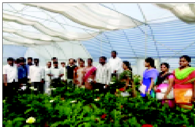
Farmers organisations practising protected cultivation of Flowers