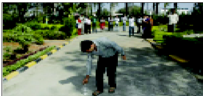
Creative walk by the trainees