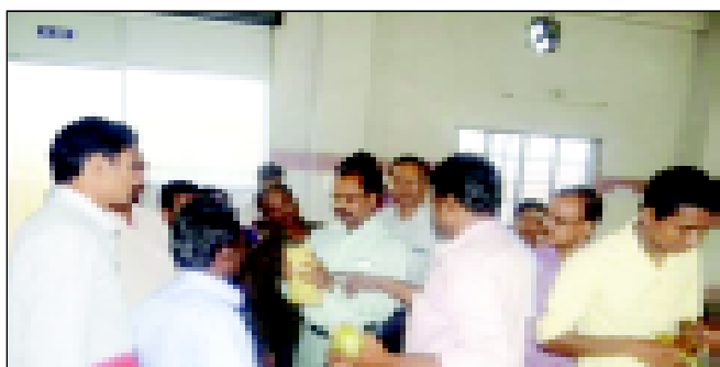
Exposure visit to VH Agro Foods Pvt., Ltd.

Extension today is market oriented and demand based. 'Market led extension for profitable agriculture'