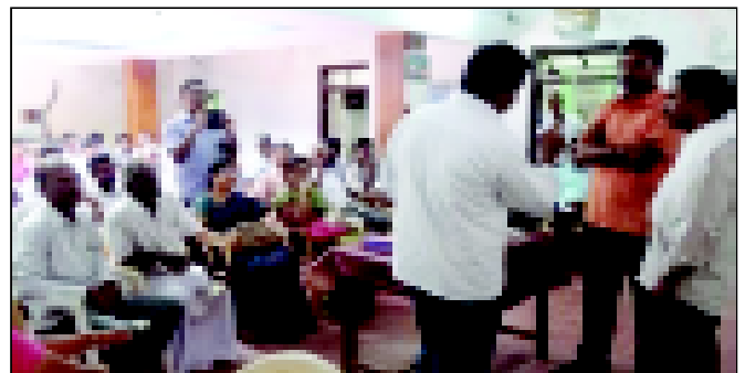
Role play by the participants