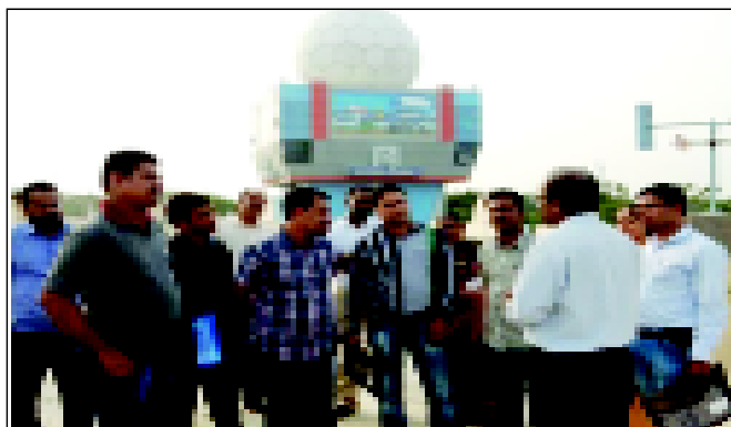
Visit to Indian Meteorological Department, Hyderabad