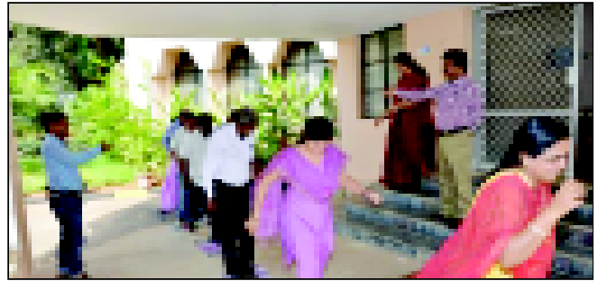
‘Titanic’ Management game for participants

said that effective leadership is putting first things first and their first responsibility is development of farmers. She urged the officers to utilize all skills learnt and unlock their potential to lead activities.